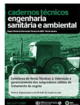
ABES BRAZIL ESA MAGAZINE