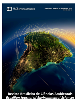
ABES BRAZIL BRASILEIRA DE CIENCIAS AMBIENTAIS MAGAZINE