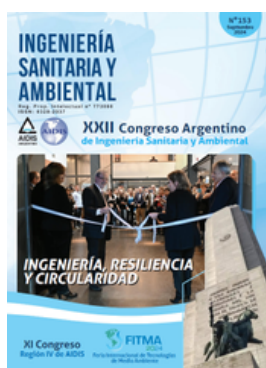
AIDIS ARGENTINA ISA MAGAZINE