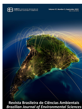
ABES BRASIL BRASILEIRA DE CIÊNCIAS AMBIENTAIS MAGAZINE