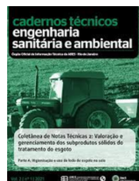
ABES BRASIL ESA MAGAZINE