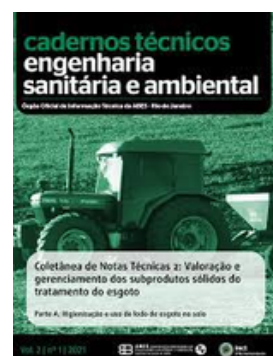
ABES BRASIL ESA MAGAZINE