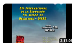
Webinario Día Internacional para la Reducción del Riesgo de Desastre...