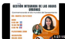
Gestión Integrada de las Aguas Urbanas