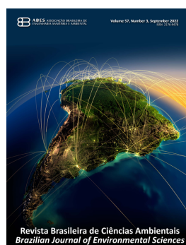
ABES BRASIL BRASILEIRA DE CIÊNCIAS AMBIENTAIS MAGAZINE