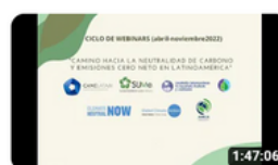
Serie de Webinars "Camino hacia la neutralidad de carbono y emisión...