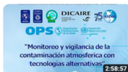
Webinario "Monitoreo y vigilancia de la contaminación atmosférica...