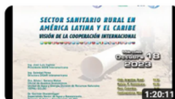
"SECTOR SANITARIO RURAL EN AMÉRICA LATINA Y EL CARIBE....