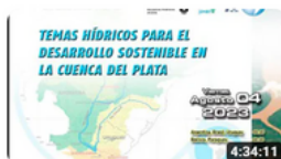
Webinario "TEMAS HÍDRICOS PARA EL DESARROLLO SOSTENIBLE EN...