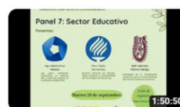
Serie de Webinars "Camino hacia la neutralidad de carbono y emisión...