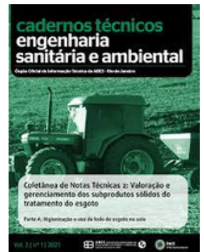
ABES BRASIL REVISTA ESA