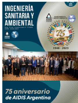
AIDIS ARGENTINA REVISTA ISA