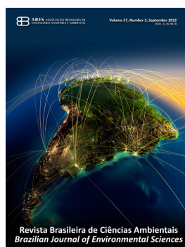
ABES BRASIL BRAZILIAN ENVIRONMENTAL SCIENCES MAGAZINE