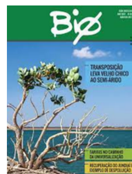
ABES BRAZILIAN BIO MAGAZINE