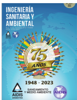
AIDIS ARGENTINA ISA MAGAZINE