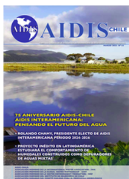
AIDIS CHILE MAGAZINE