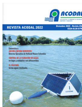
ACODAL COLOMBIAN MAGAZINE