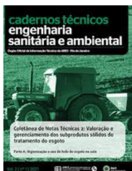
ABES BRAZILIAN ESA MAGAZINE