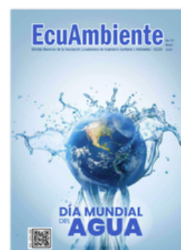
AEISA ECUADORIAN MAGAZINE